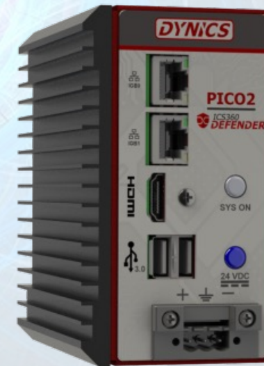
PICO – 24VDC