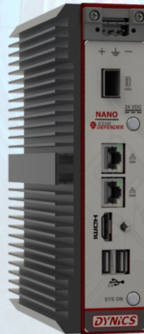
NANO – 24VDC