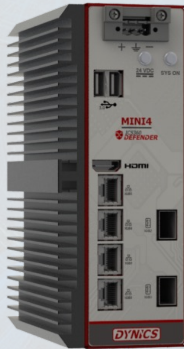
MINI – 24VDC

ICS360.Defender has moved to a new h/w platform